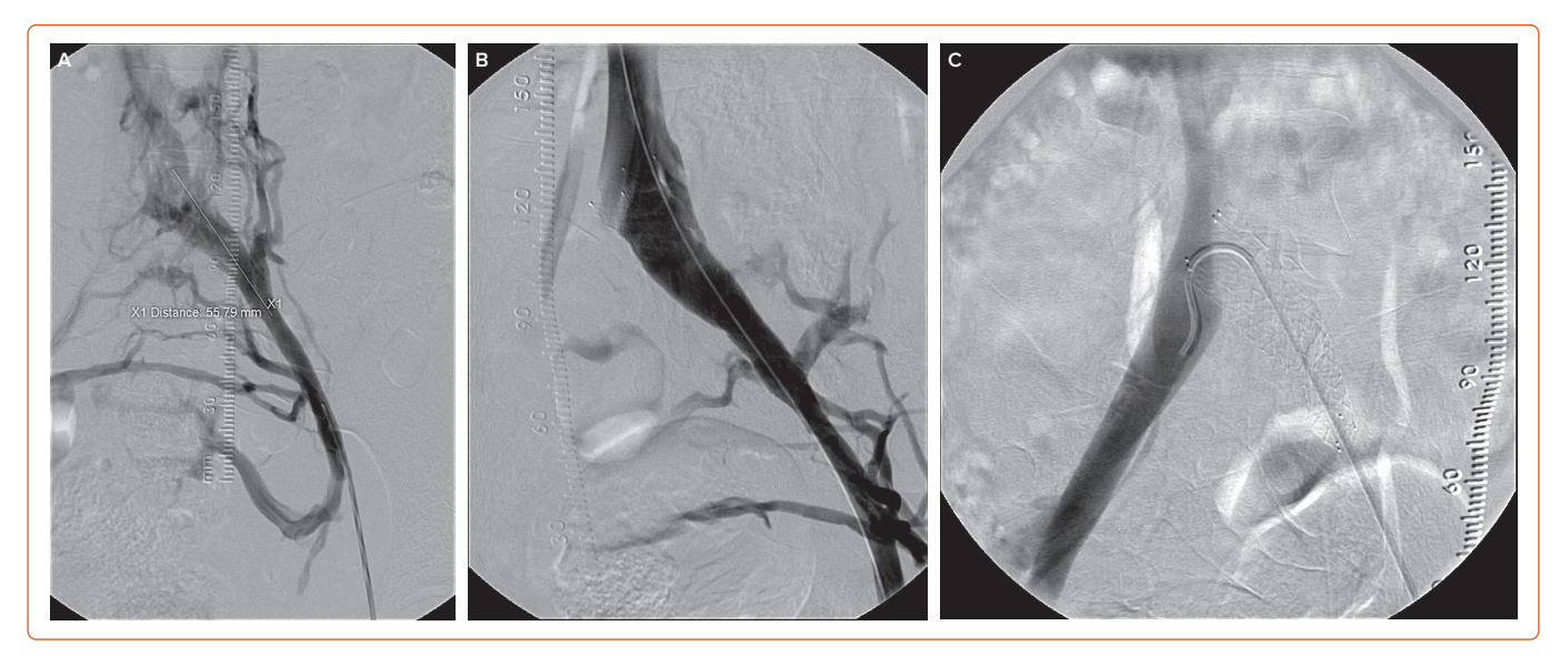
Figure 4: Zilver Vena Placement for Post-thrombotic Syndrome Stenosis

A: Left post-thrombotic left iliac vein stenoses. B: Zilver Vena placement to treat iliac vein stenosis. C: Zilver Vena placement on the iliocaval confluence not jeopardising the contralateral ilic vein