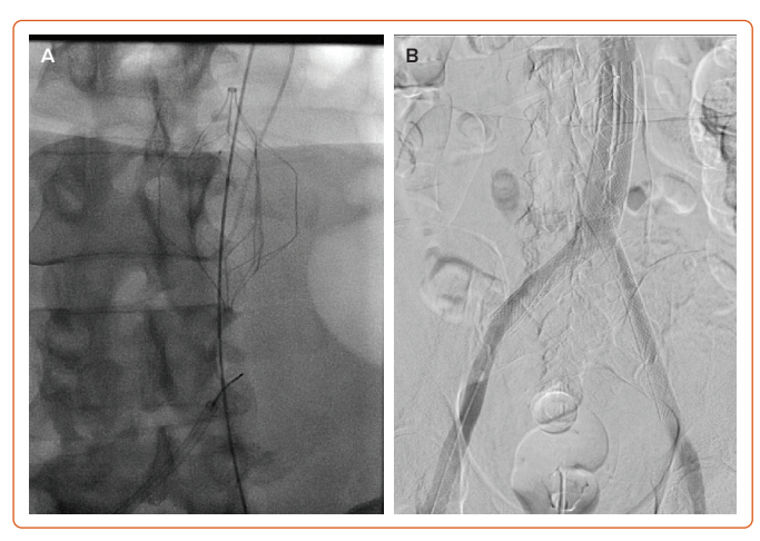
A: Occluded Inferior Vena Cava Filter treated with aspiration thrombectomy. B: Double barrel WALLSTENT placement with displacement of the IVC filter laterally.

balloon for pre- and post-dilation is necessary for venous lesions. Generally, the stent size is based on the proximal or distal normalappearing vein. The diameter of this normal-appearing vein is measured, and most interventionalists then add 2 mm for dedicated venous stents, ensuring placement and no risk of migration. Therefore, stent coverage from normal to normal is necessary, and a longer stent rather than a shorter stent is preferred. Complete stent coverage means longer stents, which also equates to less chance of migration to the right heart if undersized. Limbs with post-thrombotic disease may require extension of the stent below the inguinal ligament into the common femoral vein. The stent end should remain above the orifice of the deep femoral vein, which provides adequate inflow in most instances to sustain the stent. Occasionally, the stent can be delivered into the deep femoral vein (via jugular, popliteal or direct deep femoral access) if its ostium is involved in the post-thrombotic process. Stent fractures and erosions have been rare with stents crossing the joint crease, and patency has been shown to be sustained with a dedicated venous stent.<sup>19</sup>