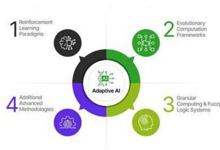
Figure 1: Adaptive AI [24]

The data clearly illustrates that the adaptive system not only enhanced assessment precision but also optimized learner experience through reduced test duration and lower cognitive load. The reinforcement learning model successfully adjusted difficulty progression according to each learner’s trajectory, which resulted in smoother transitions between question levels and minimized frustration associated with mismatched difficulty levels.